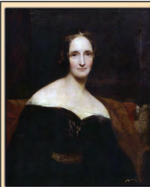
This portrait of Mary Shelley was painted by 19th-century Irish portrait and genre painter Richard Rothwell.

She was born Mary Wollstonecraft Godwin on August 30, 1797. Her father, William Godwin, was a political philosopher and her mother, Mary Wollstonecraft, was a philosopher and feminist.