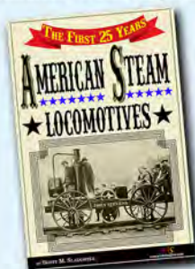
My latest book is American Steam Locomotives: The First 25 Years and will be available January 2021.

Abacus Software was a respected and successful publisher of books about subjects ranging from computers (do you remember the Commodore 64?) to photography but perhaps gained its greatest success in publishing add-on software and books for Microsoft Flight Simulator and Microsoft Train Simulator. I edited or wrote many of these books and the manuals that accompanied the add-on software. In addition to editing/writing books, I also wrote articles and reviews for Flight Simulator World magazine.